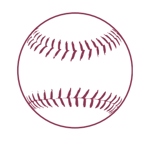
Best Buddy Sponsor $500